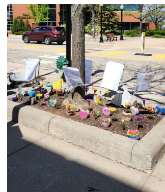
"Winne" owls painted courtesy of the kindergarteners at Valley Christian School.

Downtown Neenah is a sight to see during Future Neenah's Spring Fling now through June 9th. If you haven't taken a stroll to see the decorated flower beds, you're missing out! Mark your calendar for the Neenah Farmers Market Kid's Days on June 22nd and July 20th from 9:00 am to 12:00 pm. The kids can enjoy a bounce house sponsored by WinCU and fun at Shattuck Park. The full calendar of events can be found at Neenah.org .