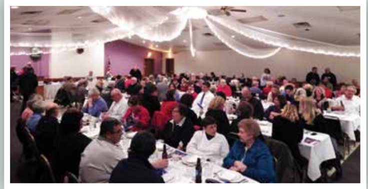
Over 125 members attended last years meeting

The primary difference between a credit union and a bank is ownership. Banks are owned by shareholders and decisions are made to their benefit. Credit Unions are owned by members who benefit from lower-loan rates, higher-deposit rates and fewer fees.